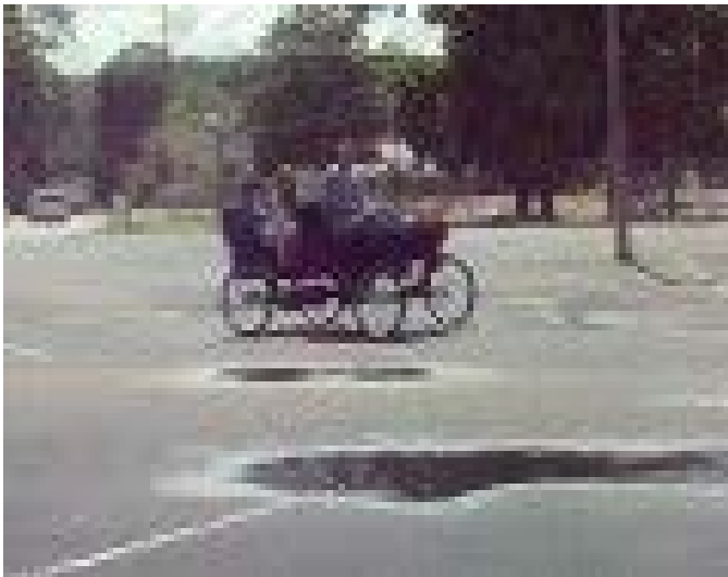
1900's Horseless Carriage